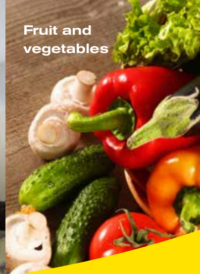
Fruit and vegetables