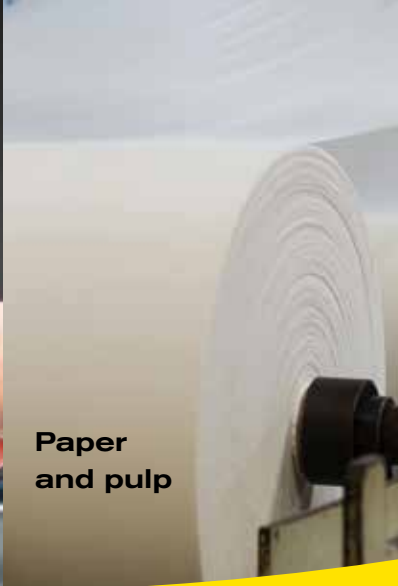
Paper and pulp