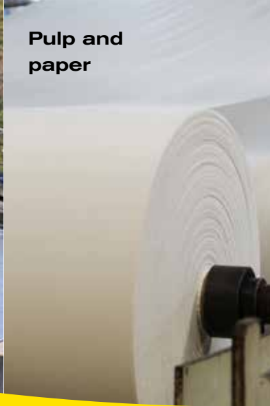
Pulp and paper