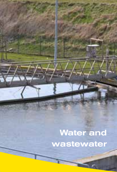
Water and wastewater