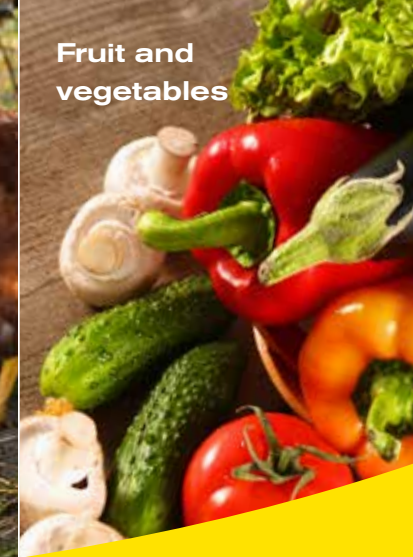
Fruit and vegetables